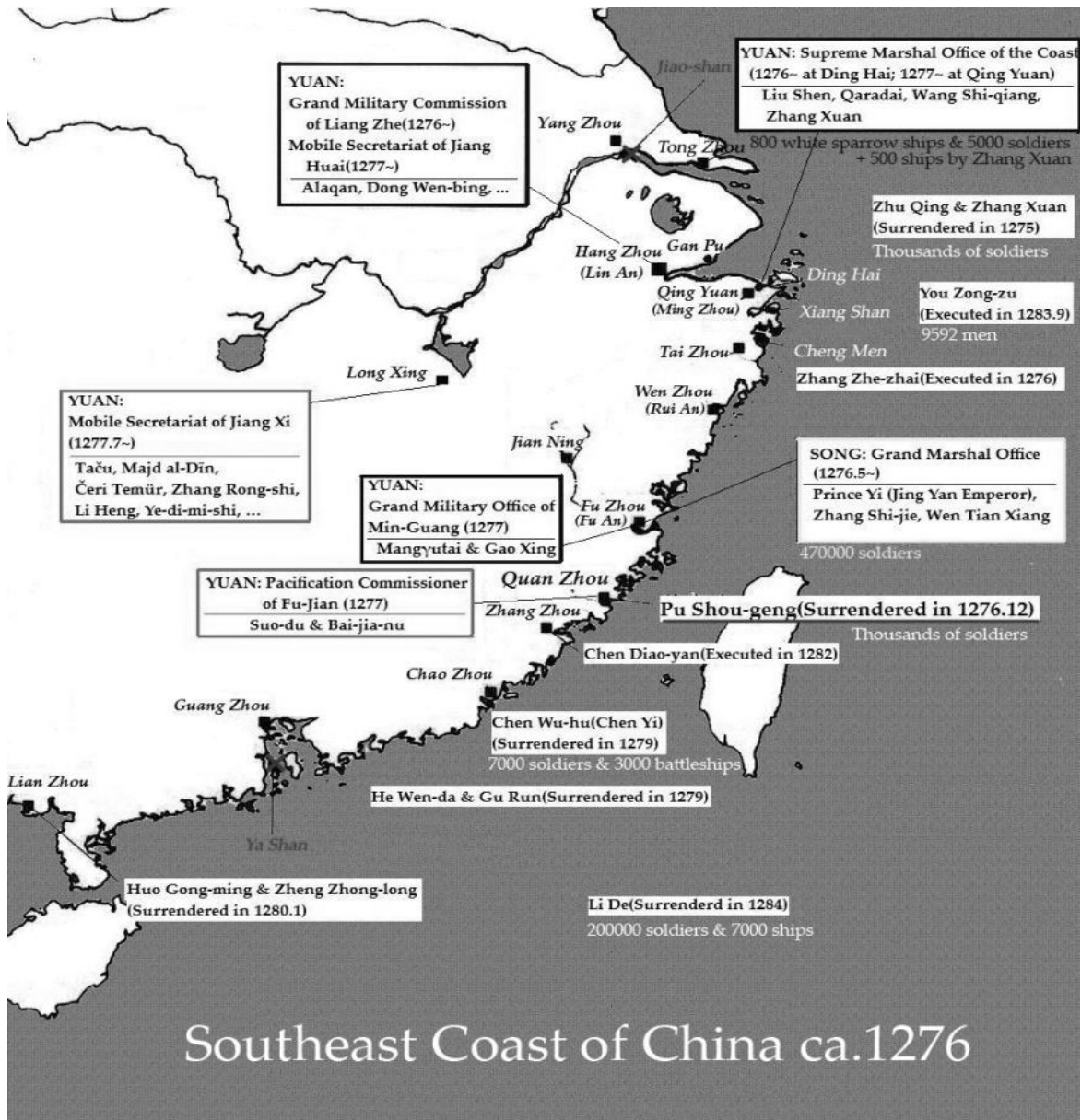
Map3. Military Situation of the Southeast Coast of China around 1276

The ruling system of South China was constructed by the hands of Mongol generals stationed there and the connections of each branches of the Yuan troops was kept in the administrations after the war. 20