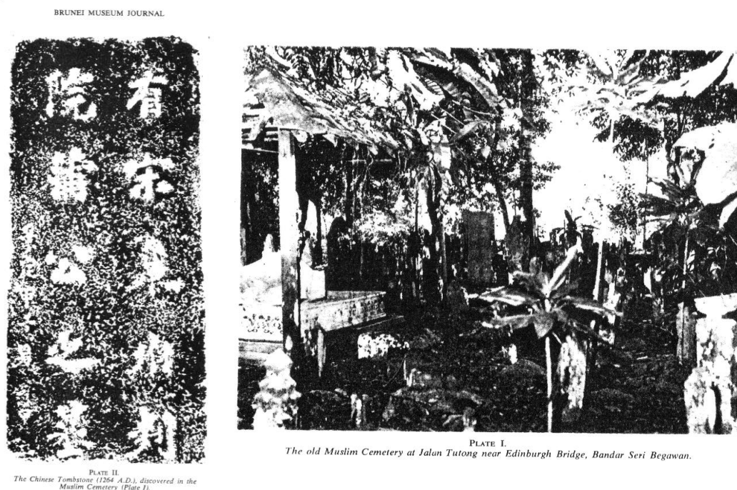
Figure 1. The Grave Stone of Pu banyuan dated 1264 and the Old Muslim Cemetery in Bandar sri bugawan, Brunei.

An example of Arab, Persian descendants in the “dual” process of assimilation can be seen in an old Chinese stele found in the Muslim cemetery in the capital of Brunei darussalam, Bandar sri bugawan (See Figure 1). It says, “The grave of Pu 蒲, banyuan 判院 (a local official title) from Quanzhou erected in 1264.” It clearly indicate the process of Sinicization in culture because it was written in Chinese and in business type for their base of activity is considered to have been in Quanzhou. 7